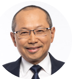
Tan Sri Abdul Wahid Omar Chairman, Cypark Resources & Former Minister in the Prime Minister's Department (Economic Planning) and Former Chairman Bursa Malaysia