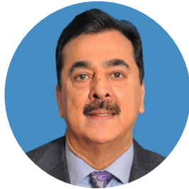
H.E. Syed Yousaf Raza Gilani

Chairman of the Senate of Pakistan & Former Prime Minister, Pakistan