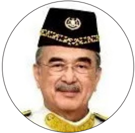
T.Y.T Tun Seri Setia (Dr) Haji Mohd Ali bin Mohd Rustam

Yang di-Pertua Negeri Melaka, Malaysia (Governor of the State of Melaka, Malaysia)